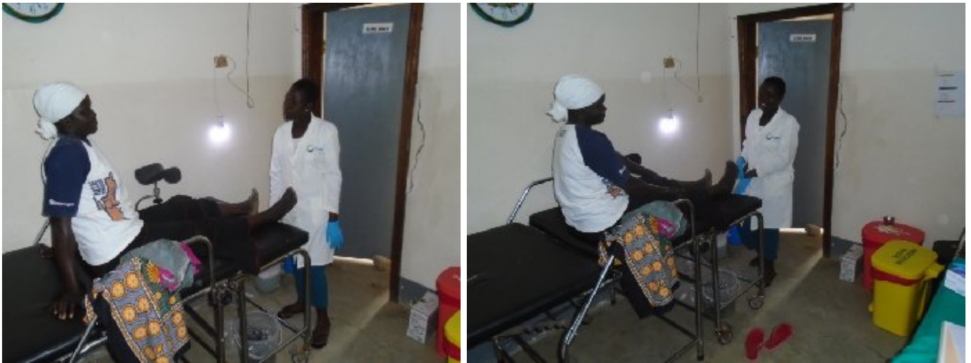
Cancer screening services during SRH outreach to Koboko district.

Cancer of cervix continues to be one of the silent health problems among the women and men in many parts of the country. Many women in West Nile are at high disadvantage due to inadequate information and distance to the centers where cancer screening is provided since most health facility workers cannot offer the service since they are not trained in cancer screening. This there means that those in need of the service have to travel long distance to get help.