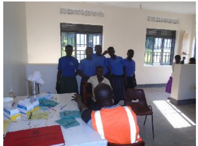
HIV counseling and testing services at the CICO project clinic.