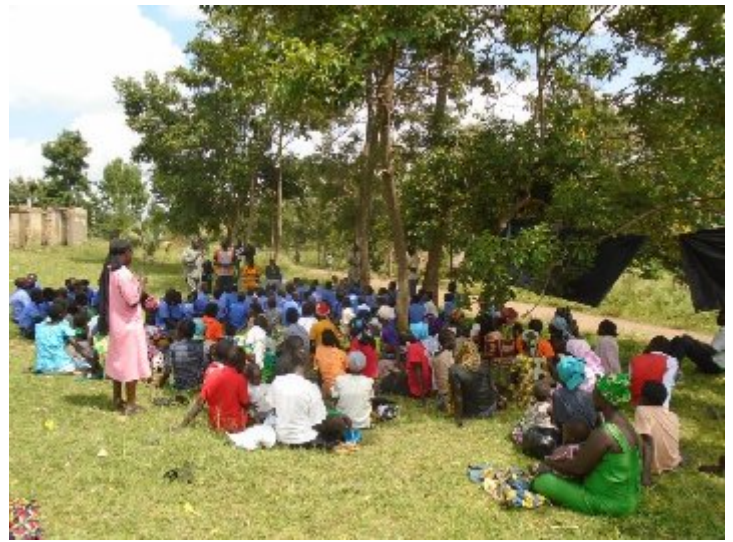
CENU/RHU program officers sensitizing the community members in Koboko district during the Health Camps.